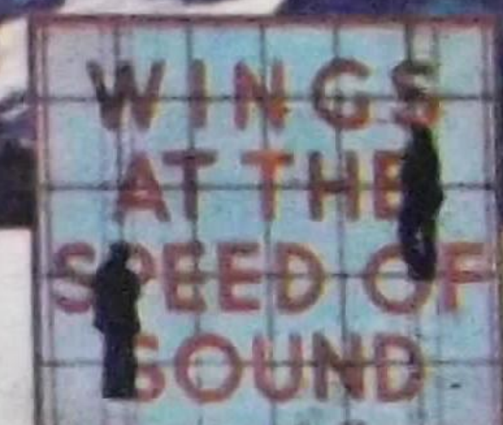
LET 'EM IN ©1972