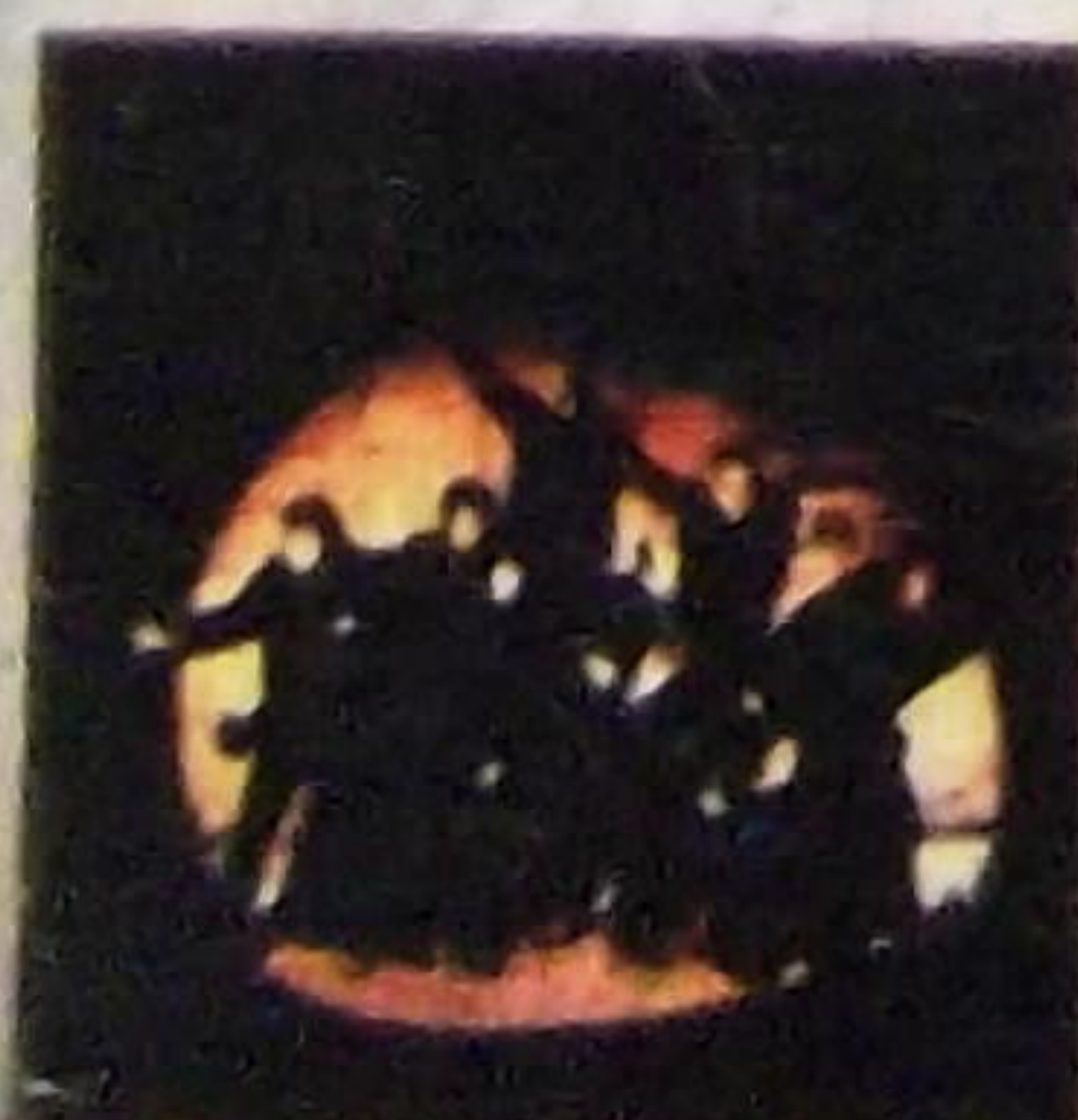
BAND ON THE RUN 1973 ©