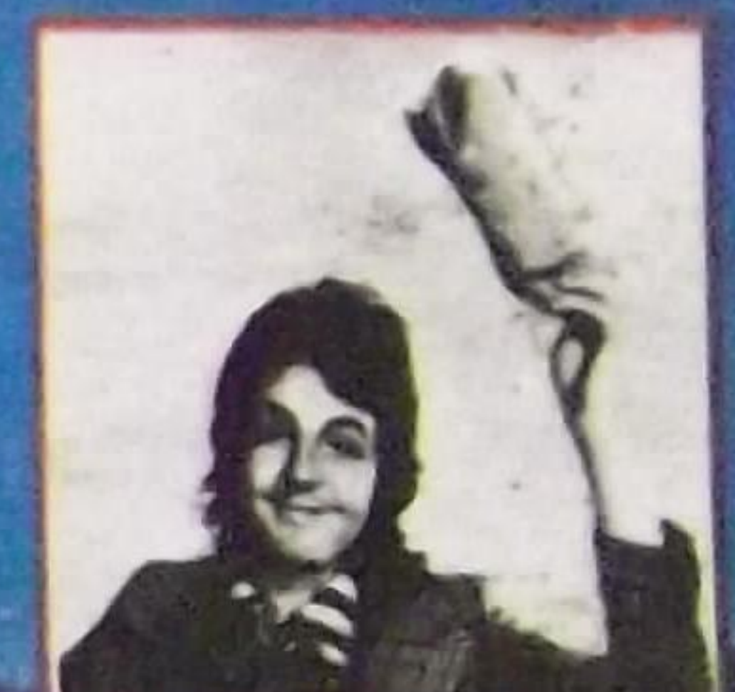
HI HI HI ©1972