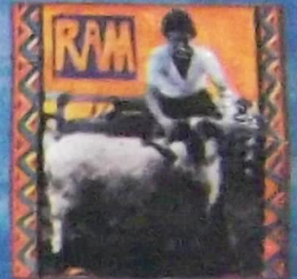
UNCLE ALBERT/ ADMIRAL HALSEY ©1971