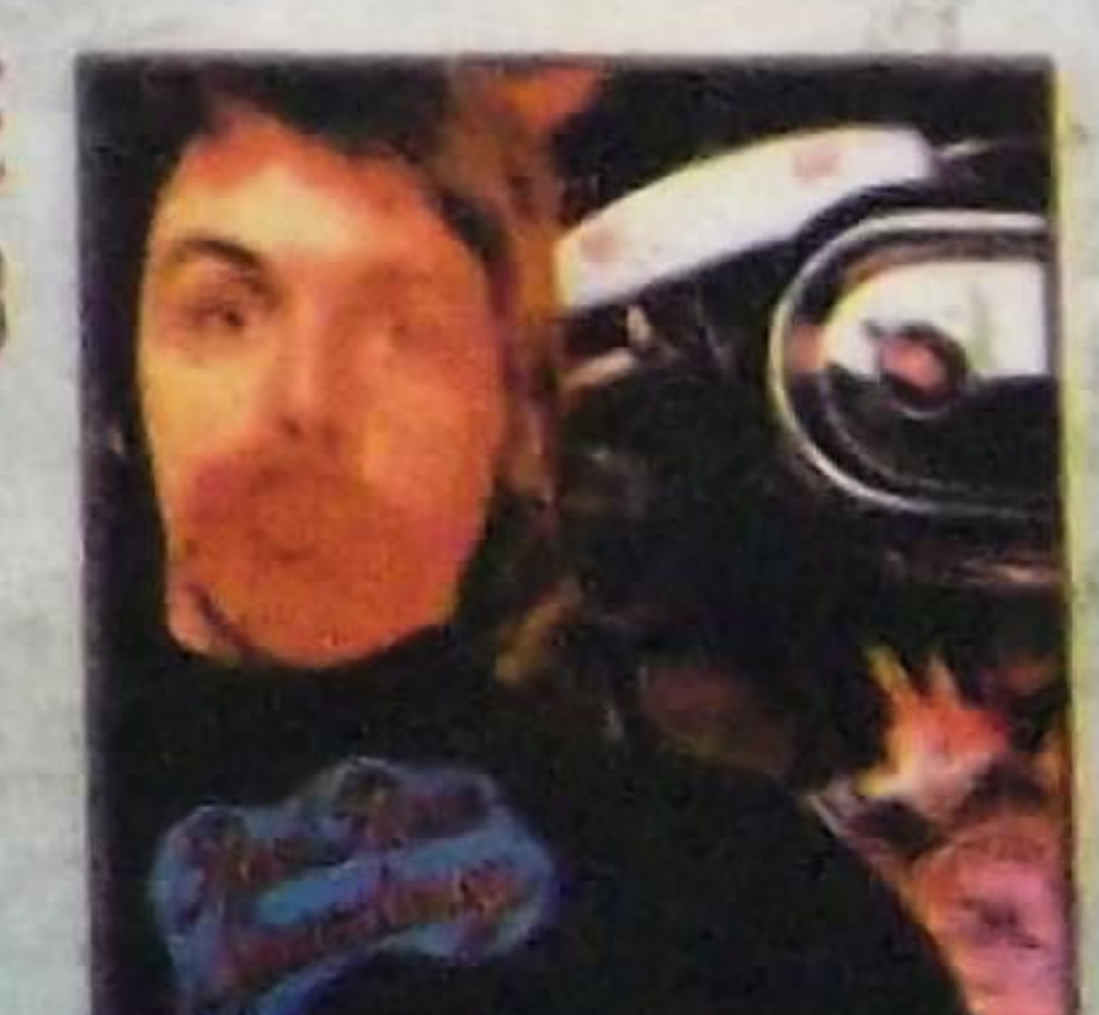
MY LOVE ©1973