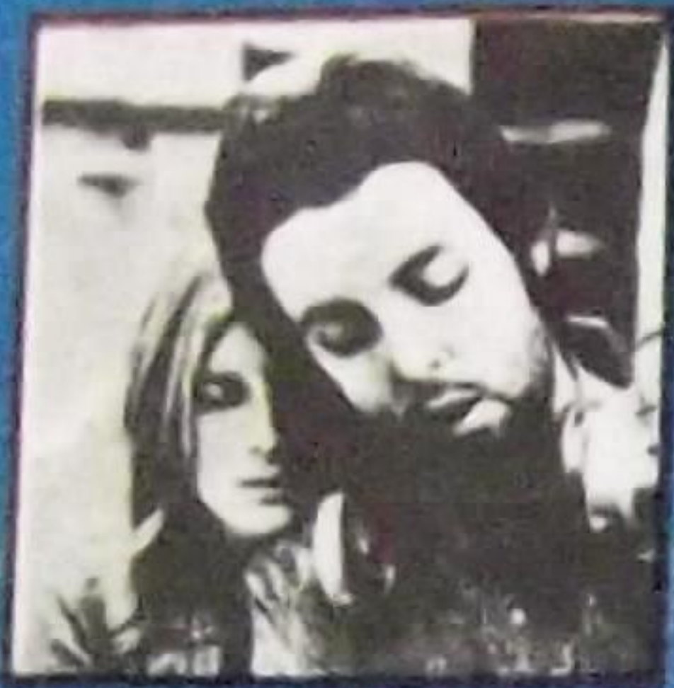
ANOTHER DAY 1971 ©