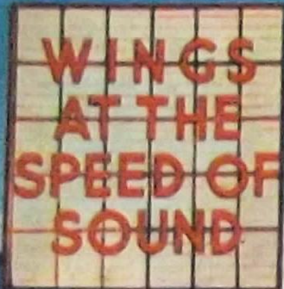
SILLY LOVE SONGS 1976 ©