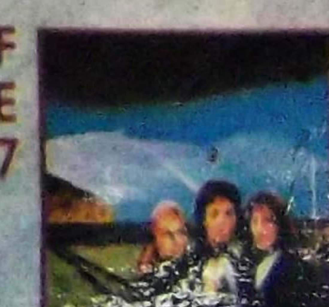
MULL OF KINTYRE ©1977