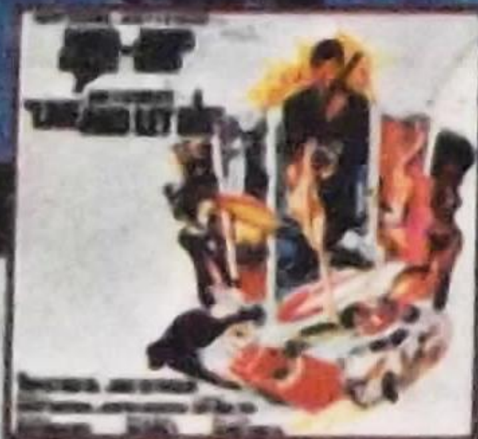
LIVE AND LET DIE 1973 ©