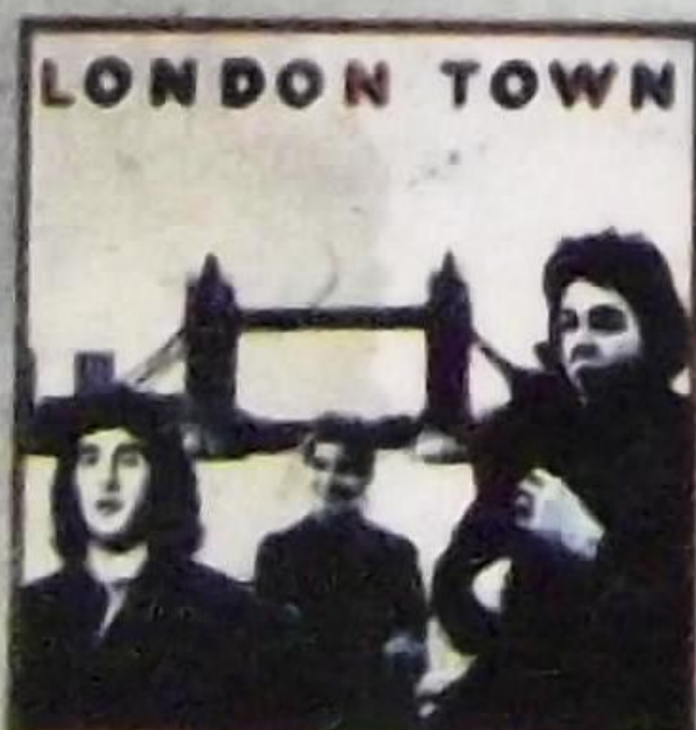
WITH A LITTLE LUCK 1978 ©