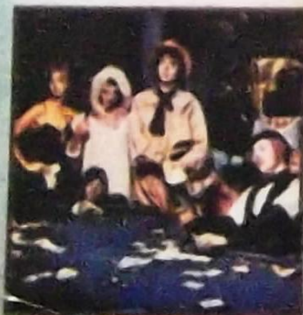
JUNIOR'S FARM 1974 ©